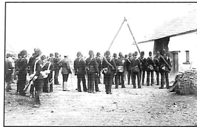
Cleary eviction.

the late Victorian period. If we are looking at a photograph of a ram at an eviction in the late Victorian era we are looking at the Vandeleur ram.