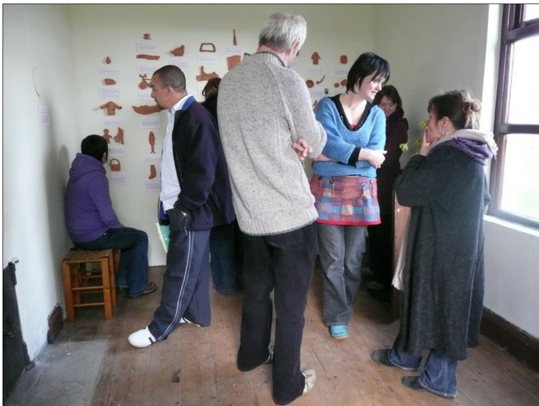
Session 6, X-PO Corrosion

Assessing the value of art created in health and disability settings was a topic of discussion which provided lively comment and opinion. The relationship of the artist to the work is another way of coming to the same question. It was argued that while the work of non artists (in the professional sense) may never reach art audiences (nor is it necessarily a motivating factor) that they have an inherent value and can be spontaneous, and as inspiring, thoughtful and moving as 'officially appreciated' work. Artists sometimes purchased the work of participants.