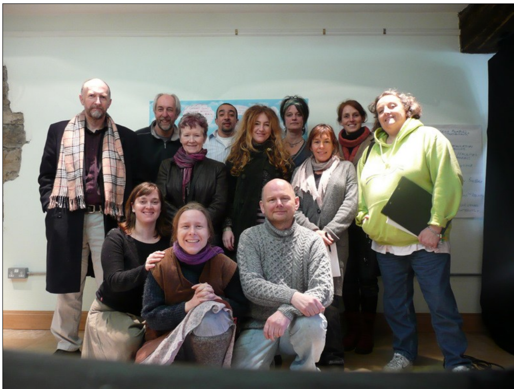
Session 5, Nature Quest Gallery, Kilrush

experience and to tease out the various issues arising from this complex area of work. The discussions among the group were far ranging and proved to be stimulating and engaging - spanning an examination of particular instances where artists felt personally and artistically challenged, the value of Arts & Health or indeed one's own attitude to illness and disability. This all took place in the most respectful manner. Artists expressed a difficulty, with some disappointment, in attending all of the sessions and this proved most difficult for parents of small children and those who had work commitments on the day. In the last session 6 artists, committed members of the group, were unable to attend.